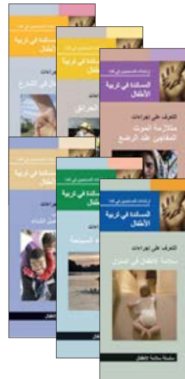
The New in Canada Parenting Support Child Safety Series—a series of newcomer-focused health and safety brochures that are available in 11 languages, including Arabic

Learning a few words in Arabic and having resources for your program will assist the team to understand needs, communicate with families and work with the children. Burnaby Public Library’s Embracing Diversity Project audio/videos provides great resources that can help you learn the words and pronunciation of Welcoming Phrases in Arabic , a list of 100 Common Arabic Words , and Arabic Songs . CMAS has also created a helpful tip sheet of 15 Arabic Words that you can use in your program.